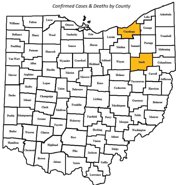
Confirmed Cases & Deaths by County